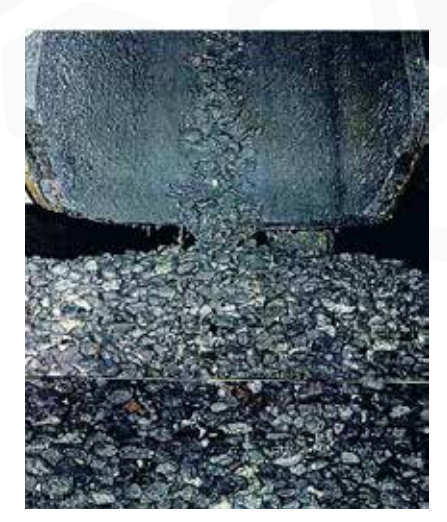
Grinding ball chips collected by the Trunnion Magnet System.

Complete Trunnion Magnet System installed with discharge chute and spray hose.